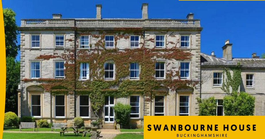
SWANBOURNE HOUSE BUCKINGHAMSHIRE