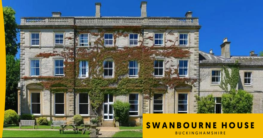
SWANBOURNE HOUSE BUCKINGHAMSHIRE