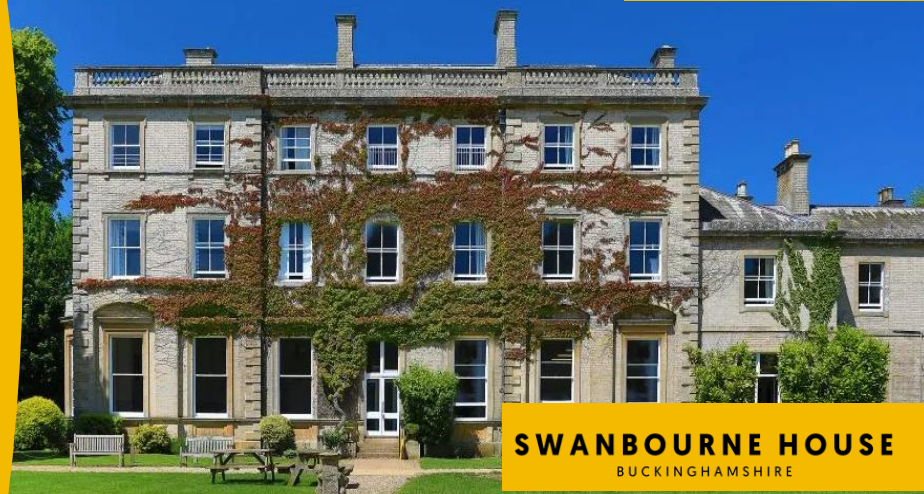
SWANBOURNE HOUSE BUCKINGHAMSHIRE